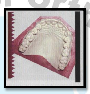
10- Occlude models. Trim upper heels so they are flush with lower heels