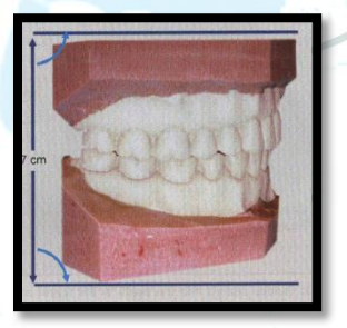
12- Occluded models should have a sharp 90° angle between their base and back