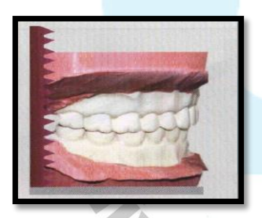
3-With models in occlusion, trim upper back so it is flush with the lower back