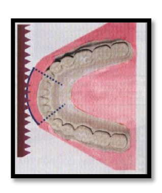
7- Make a smooth curve from canine to canine In lower models