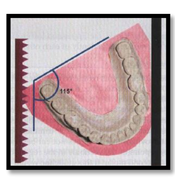
8- Move model trimmer guide to its extreme Position to make the heel