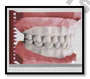
5- Occlude models. Check bases for parallelism, backs for flush plane