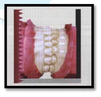
4- Place upper model (on its back) on the model trimmer. Trim until the top base is flat