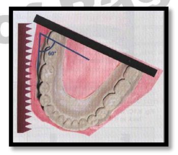
6- Make buccal cuts, at the edge of the vestibule 60° to the base of the model