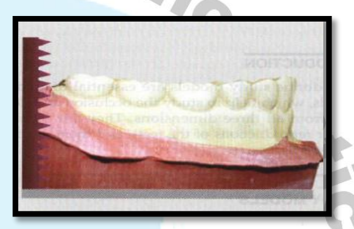
2- Trim lower back perpendicular to base