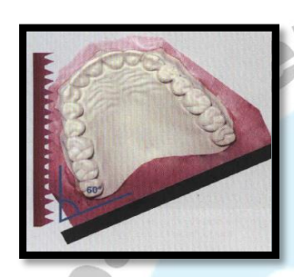
9-Make buccal cuts. at the edge of the vestibule 60°to back of the upper model