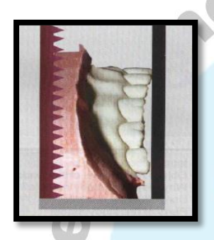
1- Trim lower base parallel to occlusal plane