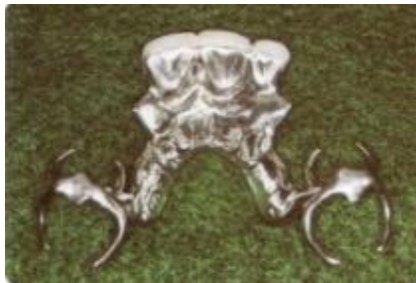
Anterior artificial teeth attached to metal denture base