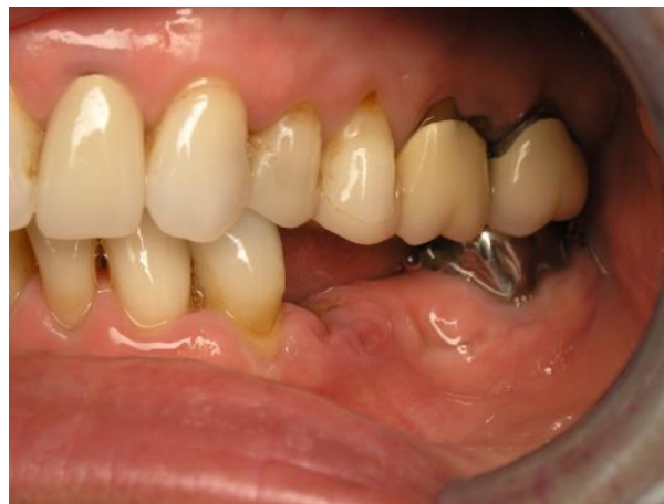
Over erupted upper 2 nd premolar and 1 st molar