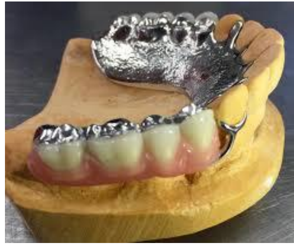
Partial dentures with metal teeth