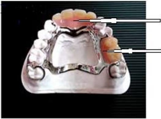
Tooth supported partial denture base

When posterior teeth only to be replace, function are of primary importance than esthetic, while when anterior teeth needed to be replaced the esthetic is of primary importance. Also of importance is elimination of undesirable food traps (oral cleanliness) and stimulation of underlying tissue.