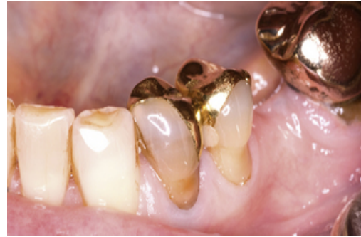
Three-quarter crown which is a partial crown covering all tooth surfaces except the buccal surface.