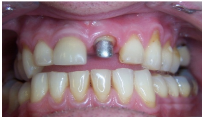
Post crown which replaces the natural crown entirely and retains itself by means of a dowel (post) extended inside the root canal space.