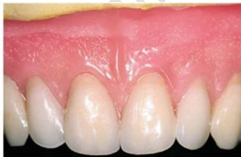
Anatomical features reproduced in the appearance of a denture flange.