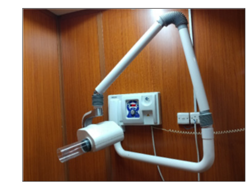
Figure 3: The Occlusal Film.