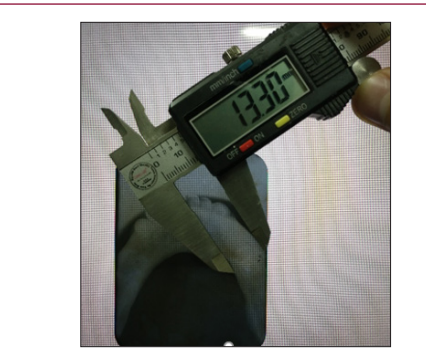
Figure 5: Taking Measurements.

restorations may obscure the image so that all the required areas cannot be clearly seen, necessitating a re-take of that film. Using Vernier caliper (Figures 5 & 6) on zero level to measure the width of the bone, for the dentulous patients we put the arms of the Vernier on the buccal and the lingual cortical plates of the lower first molar and the measurements are taken, for the edentulous patient the position of the missing lower first molar is estimated depending on the landmarks and/or remaining teeth, and the measurements taken by putting the arms of the Vernier on the buccal and the lingual cortical plates, then these measurements are noted.