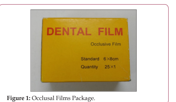
O Spool Occlusion Finite

"Prior to starting to take films, the patient must be positioned properly. Seat the patient and ask them to remove their glasses and any removable partial dentures or orthodontic appliances. Adjust the headrest to support the head while taking films. Raise or lower the chair to a comfortable height for the operator. Place the lead apron and thyroid collar on the patient (Figures 1-3). Position the head so that the occlusal plane of the mandibular teeth is 45 degrees to the horizontal plane and the median plane of the face is vertical. A film is placed into the patient's mouth, so that it is centered over the molar teeth on the side to be radiographed Adjust the tube so that the central ray will pass from below the mandible and through the molar region at a perpendicular angle to the plane of the film packet. The patient is instructed to hold still while maintaining the correct position. The operator leaves the room where he or she will press a button, to expose the film, which produces an audible beep. The operator re-enters the operatory and removes the film from the patient's mouth [9].