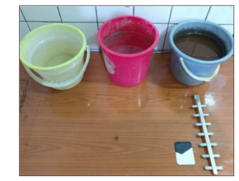
Figure 4: The Processing Room.

As illustrated in the text book (oral radiology principles and interpretation) Following film processing (Figure 4) the films were examined, the films were assessed to determine whether all areas can be visualized adequately. Anatomical variations, as well as local