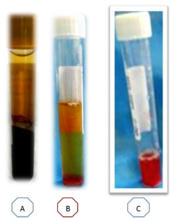
Figure 1: (A) Illustrates the separation of plasma from erythrocyte. (B) Illustrates PRP and PPP. (C) Illustrates PRP.

RPR was prepared by a sample of 10 mL of blood and is collected from every patient in 10 mL vacuum tubes containing 1ml of 10% sodium citrate for anticoagulation (Figure 1). The tubes are centrifuged at 1200 rpm for 10 min at room temperature, enabling the separation of three components (Figure 1): red cells (bottom of the tube), white cells (thin layer on top of the red cells) and plasma (top layer) then the plasma is decanted into a new sterile 10 mL tube and is centrifuged again in the same machine at the same speed for five minutes. At the stop of this centrifugation (Figure 1), the upper plasma layer that is obtained (accounting for approximately 50%) was discarded because of the small quantity of platelets. The lower portion, which is rich in platelet sand, is the PRP (Figure 1). (9)