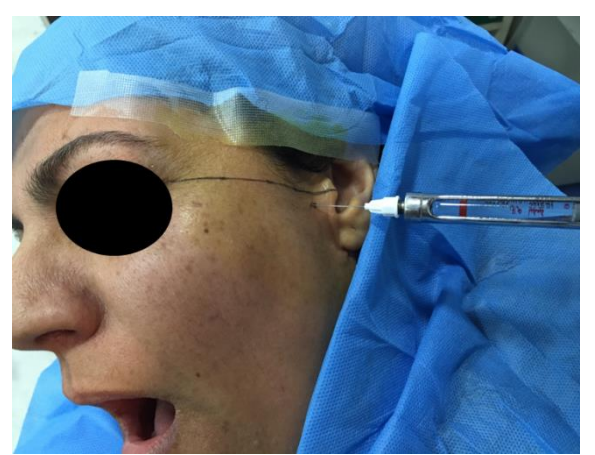
Figure 4: Illustrates injection of local anesthesia in TMJ

The PRP was injected into the joint without activating calcium chloride and thrombin because it has been shown that non-activated PRP can enhance mesenchymal stem cell proliferation, chondrogenic differentiation, and osteoinductivity. (8)