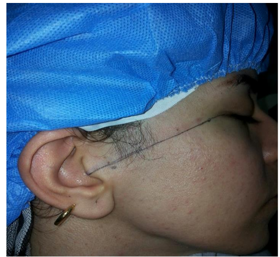
Figure 2: Illustrates the preparation of patient and points on the canthotragal line.

anticoagulant. The patient was seated at a 45° incline with their head turned contralaterally to provide a simple approach for the joint to be managed. The procedure was carried in aseptic conditions, the ear and pre-auricular skin above the TMJ was prepared and draped with topical antiseptic solution, a line was drawn from the lateral canthus to the most posterior and central point on the tragus (Holmlund-Hellsing Line) (Figure 2). (7) The posterior point of entry is located along the canthotragal line 10 mm from the middle of the tragus and 2 mm below the canthotragal line. This is the approximate area of the maximum concavity of the glenoid fossa. The distance is about 25 mm from skin to the center of the joint space, (10) the point of entry is placed 10 mm further along the canthotragal line and 2 mm below it. The auriculotemporal nerve was blocked with about 2 ml of local anesthetic, which was first injected into the joint cavity to relax this virtual space. Subsequently, the needle was gently withdrawn to the skin surface to also anesthetize the soft tissues over the joint (Figure 4) and a 21gauge needle was used for introduction into the superior joint space at the glenoid fossa Approximately 0.5 ml of PRP was injected to distend the superior joint space (Figure 3). The skin was disinfected once again after the injection.