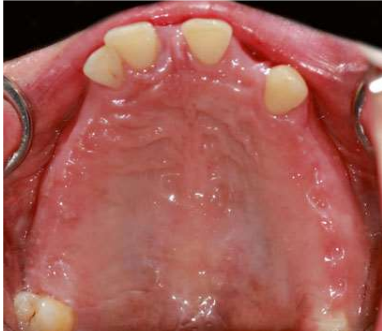
Figure 1.3: Posterior tooth loss may result in overloading of the anterior tooth. This situation may be further exacerbated by the presence of periodontal problems (Şakar, 2016).